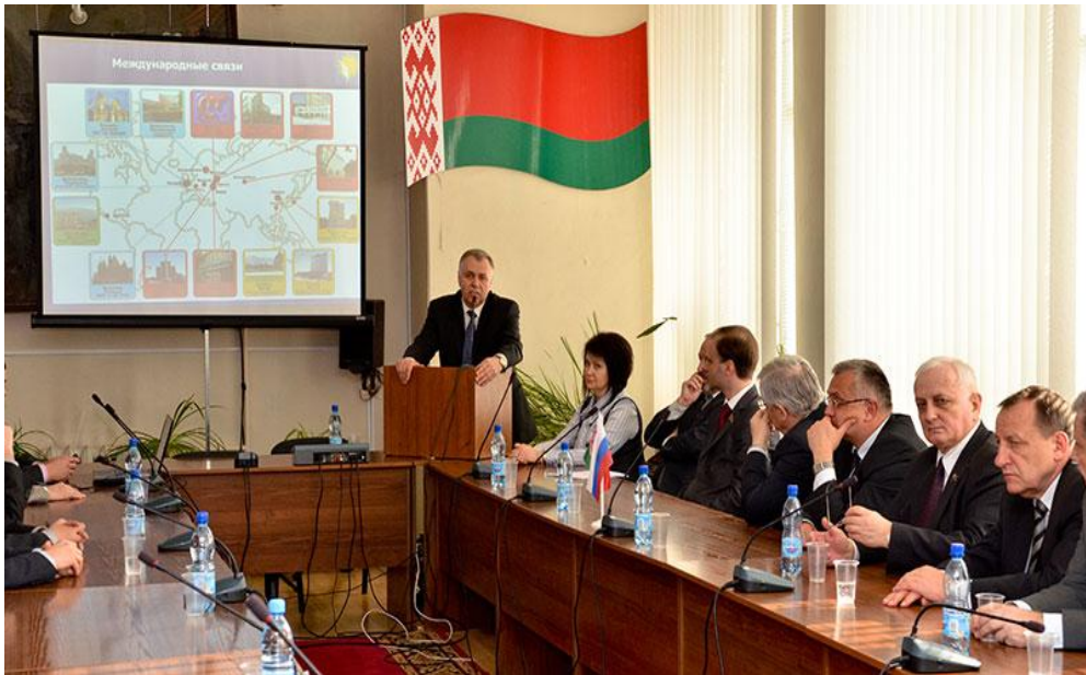
On March 27, 2015 Delegation of Parliamentary Assembly of the Union of Belarus and Russia visited Francisk Skorina Gomel State University within the framework of official visit to Gomel