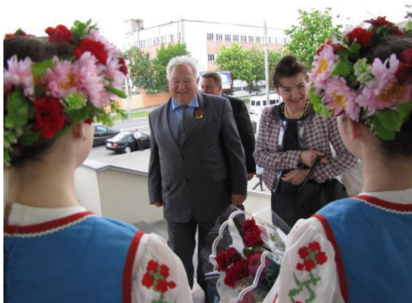
On May 18, 2011 pilot-cosmonaut, twice Hero of the Soviet Union G.M. Grechko visited our University (with his wife)