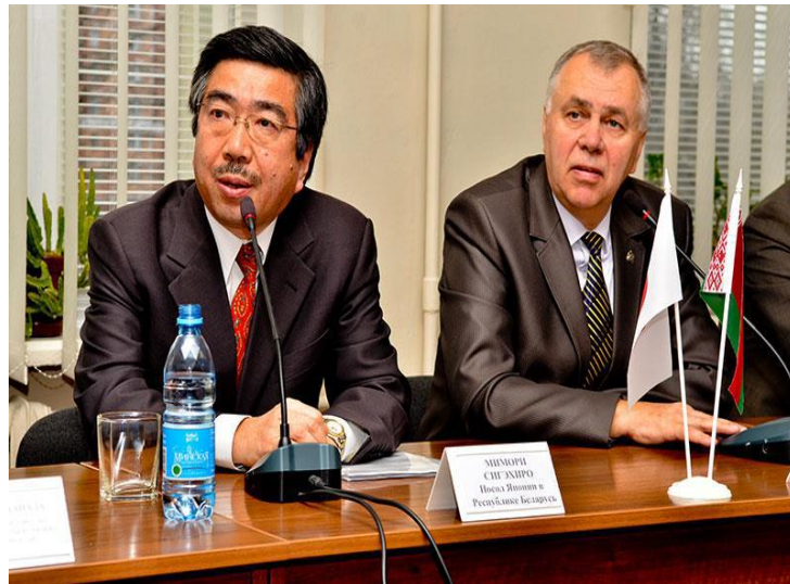
For many times the delegation of Embassy of Japan in the Republic of Belarus headed by Ambassador of Japan in the Republic of Belarus Sigehiro Mimori (on the photo – visit on November 28, 2014)